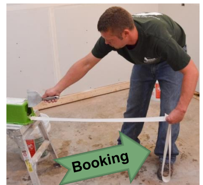
Booking the tape for longer pieces

TapeBuddy makes it easy to tape ceiling joints! Position your bench under the seam you are working on, pull out the coated tape (about 4 to 6 feet) and step onto your bench. Press one end of the tape over the seam and align the other end. Because the mud is on the tape, it will stick instantly. Embed, smooth and you're ready for the next piece. There's no mess or excess compound! See page 13 for more advice on taping butt joints.